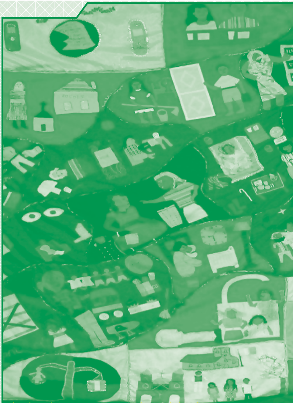
'Blurred Boundaries' Migrant Domestic Workers Speak Through Art