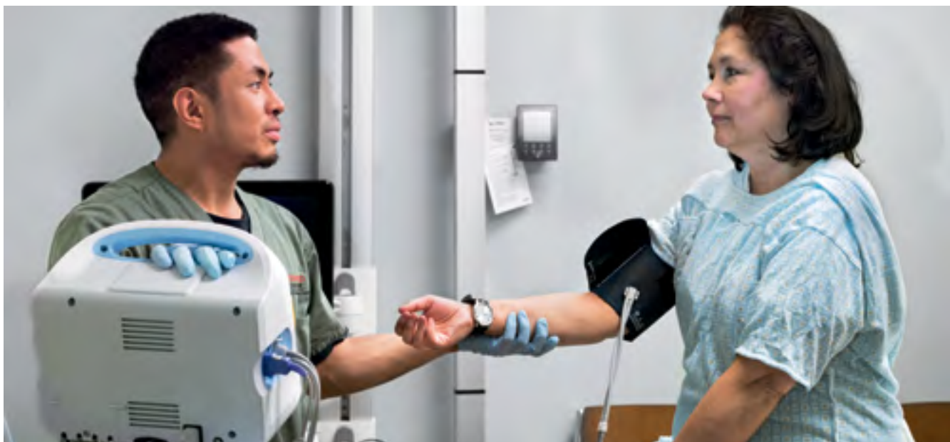
Patient being examined in the Stanford Women's Cancer Center in Palo Alto, California.